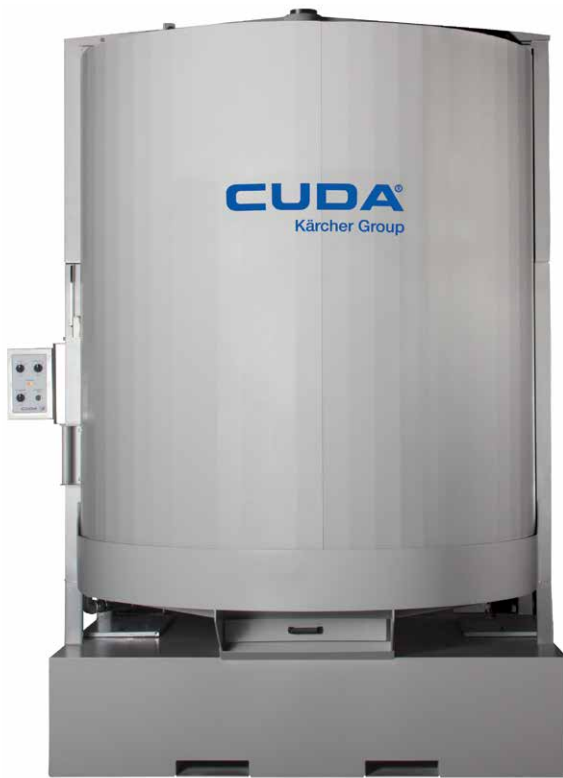
Approx. scale to 7272 model