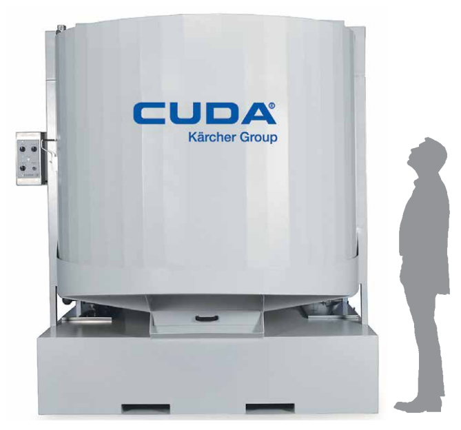
Approx. scale to 7272 model